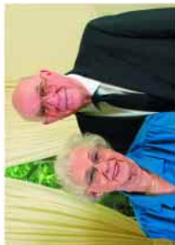
1 - 8 x 10