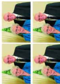
4 - 4 x 5