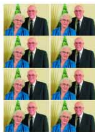
8 - Wallets