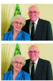
2 - 5 x 7